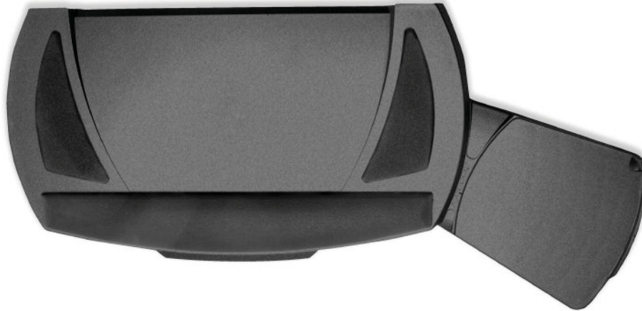
Harmony Tray—KOHT.23 (no mouse) / KOHTM.23 (with mouse)

Harmony is a premium keyboard tray. The mouse deck easily adjusts for left and right hand use. This ergonomically shaped, stable, low profile tray provides the support needed in an aesthetically pleasing design.