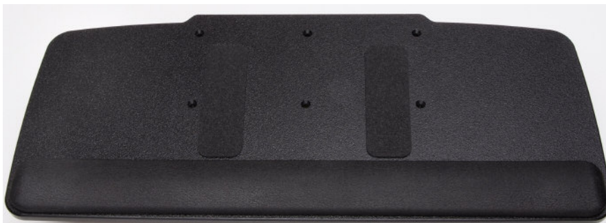
HDPE "Green" Tray—KOHDPE (no mouse) / KOHDPEs (with mouse)

Built in features include anti-skid grip strips to help prevent keyboard slippage, a built-in mouse cable manager, a plug in foam-gel wrist rest, a universal mounting pattern plus an ergonomic pull handle for easy handling. An optional 3-forward position sliding mouse deck is also available.