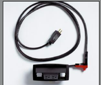
Connect allows for sequential plug and play at the worksurface.