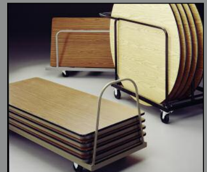
Table trucks make transporting folding tables fast and easy. Available for a variety of table sizes.

Ideal for classrooms or training facilities, the Connect™ system allows up to six PowerUp modules to be “daisy-chained” on a single power cord. Like PowerUp, Connect does not require an electrician, and it’s color-coded connections ensure that the modules are always in correct sequence.