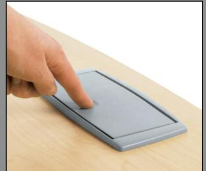
Innovative press-and-release system stows receptacles while not in use.